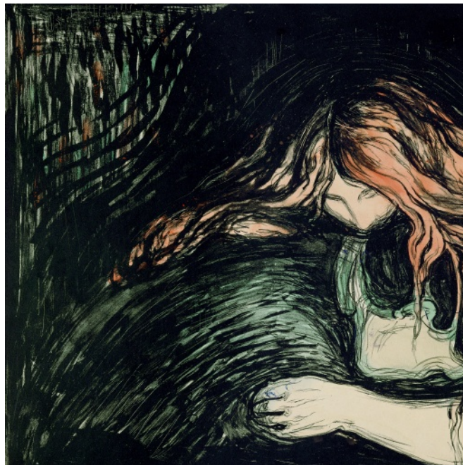
Vampire, Edward Munch 1895