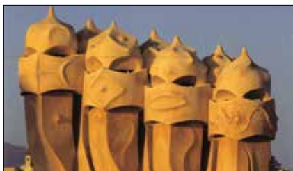
Gaudi, La Pedrera, Barcelona