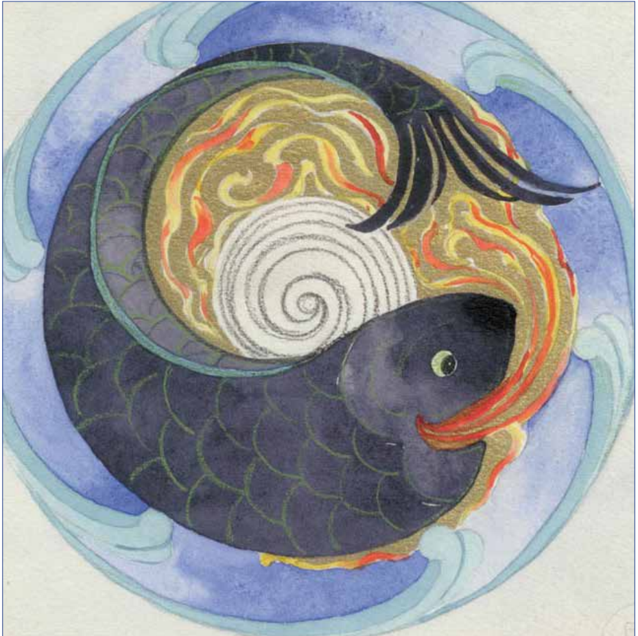
Mandala, painted by one of Jung's patients

1-year foundation course in Analytical Psychology Based on Jungian theory and practice