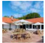
Munkerupgaard has great facilities and good food

The deposit and subsequent course fees should be paid to the account number below: