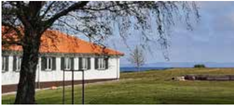
Munkerupgaard is located right by the water

The residential seminars take place at Munkerupgaard, Jørgenshvilevej 10, Munkerup, 3250 Gilleleje E-mail: hjoe@flsmidth.com Tel: +45 30 93 30 80, https://munkerupgaard.dk/