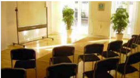
Hvidehus, teaching room

The externships take place in Hvidehus, Valbygaardsvej 64A, 2500 Valby. Tlf. 2485 0148 eller 5070 5226 email: info@hvidehus.com http://hvidehus.com/