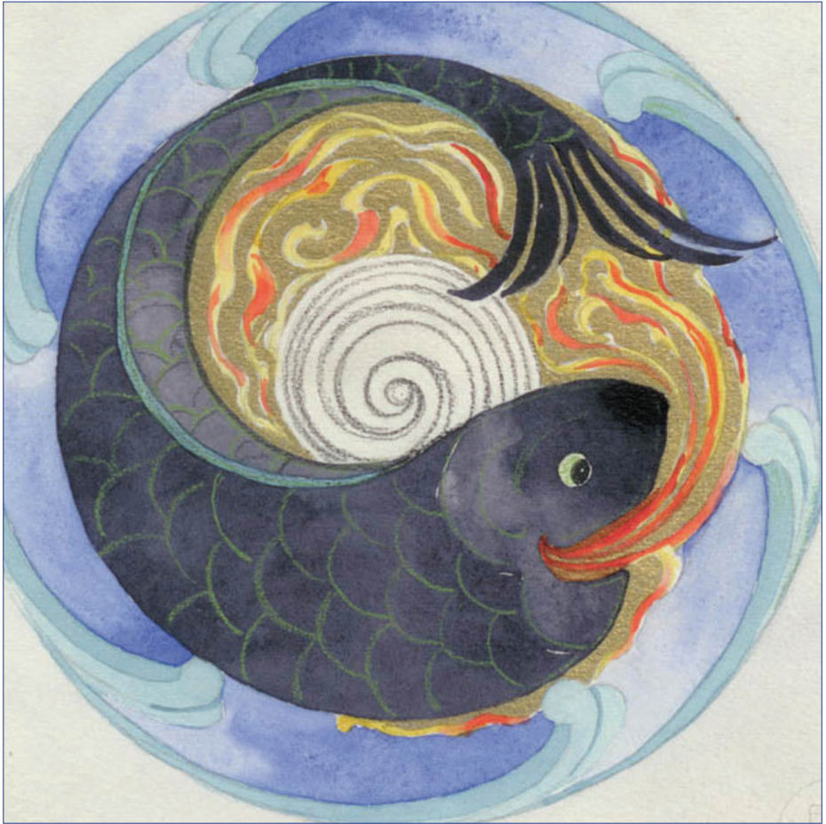
Mandala, painted by one of Jung's patients

1-year foundation course in Analytical Psychology Based on Jungian theory and practice