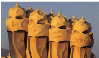
Gaudi, La Pedrera, Barcelona